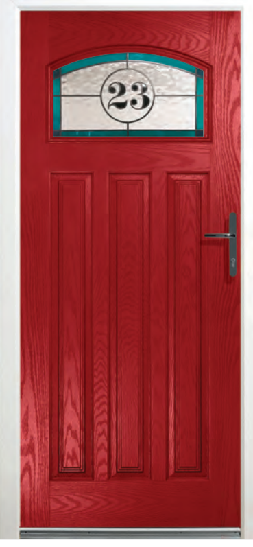
Traditional House Number