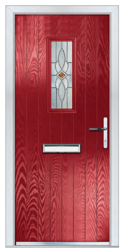
Farmhouse Cottage 1 Daventry*

* Due to manufacturing constraints our Daventry Glass design cannot be replicated in Top Lights and Side Panels, also they are not offered with any other alternative glass options including our usual Obscure and clear Glass options.