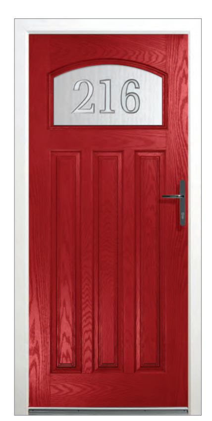
Sandblast House Number

* Due to manufacturing constraints our Infinity Glass design cannot be replicated in Top Lights and Side Panels, also they are not offered with any other alternative glass options including our usual Obscure and clear Glass options.