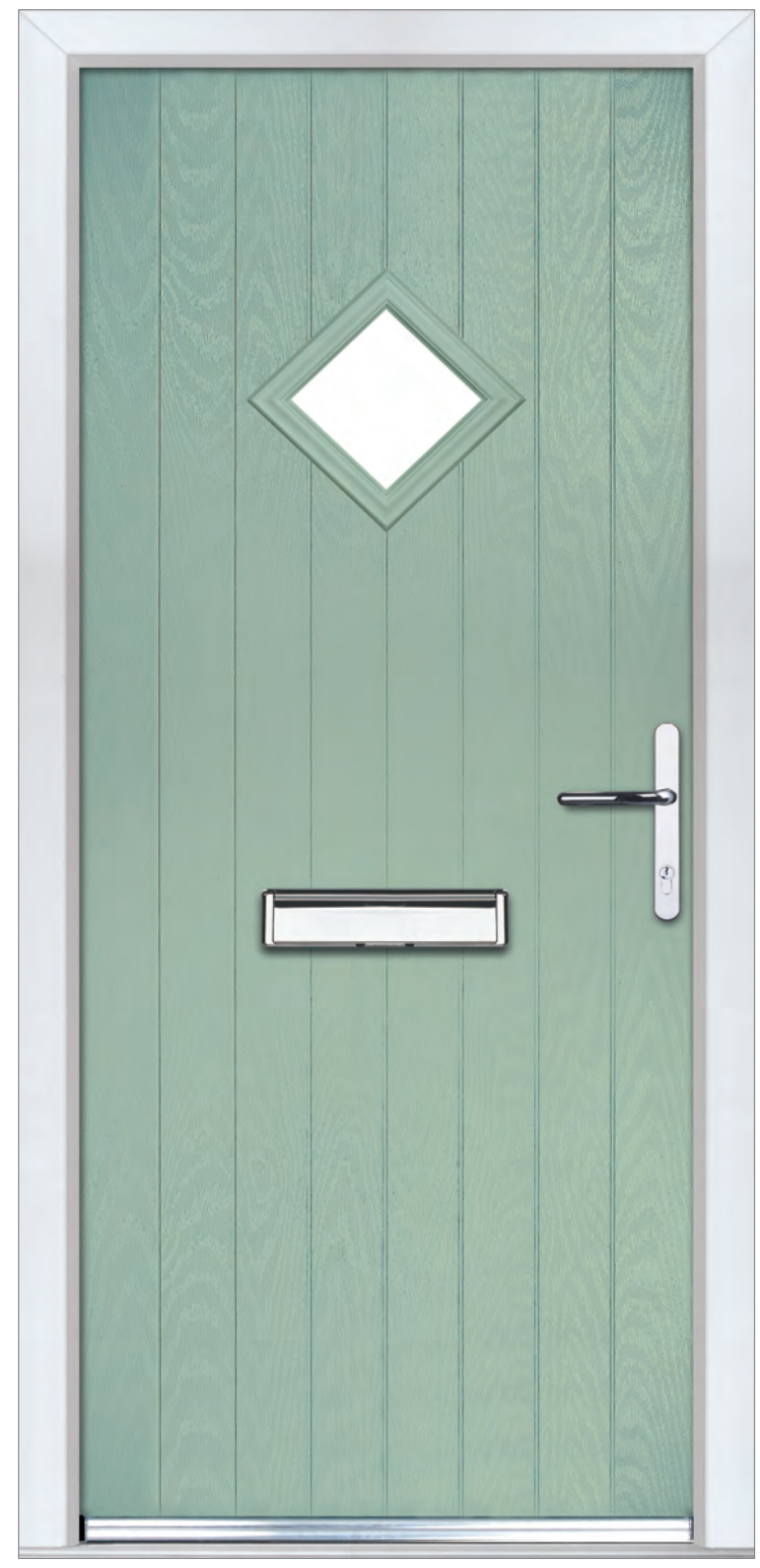
Farmhouse Cottage Diamond

Our farmhouse cottage range has a vertical etched detail